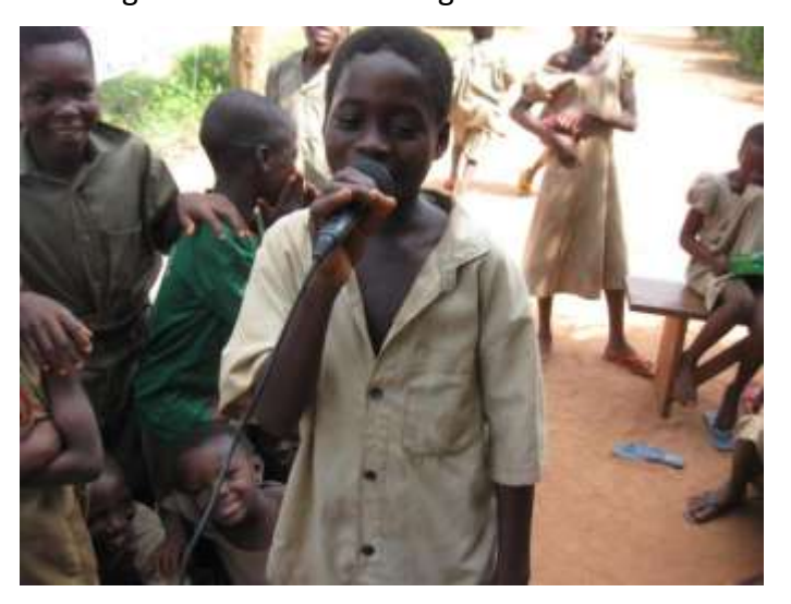
Talking about child trafficking at school

Creation and empowerment of 12 Local Youth Protection Committees (LYPC) for door-to-door follow-up and monitoring both at schools and at homes